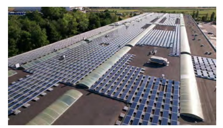
Energy efficient buildings built to BREEAM standards and high EPC ratings