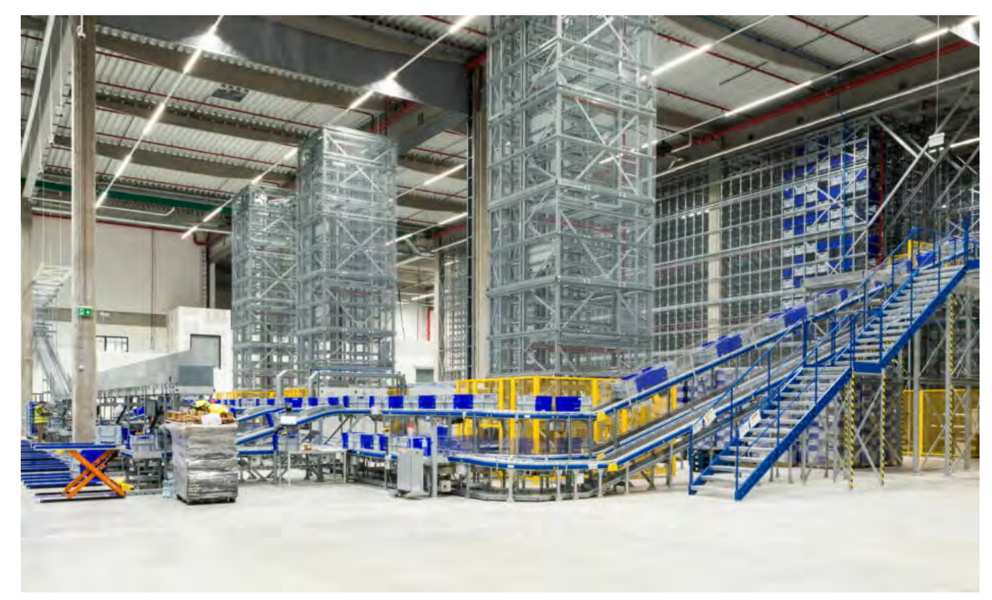
Turn-key, built-to-suit solutions to fit clients' exact requirements